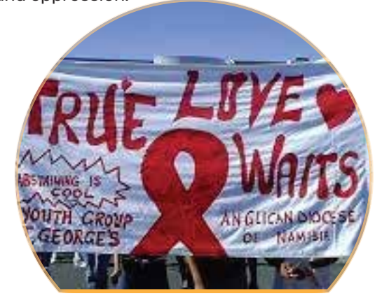
RDP MANIFESTO PAGE 69

RDP considers its support for civic and professional organizations that organize sectors of the Namibian population and guarantee the effective participation of civic society, in the social, economic and cultural activities in Namibia. This includes but not limited to the inculcation of positive morality of the people of Namibia. Historically the church and other faith based institutions have played and continue to play a major role in the Namibian society, particularly in terms of education and training and political conscience that led to a large section of Namibian population into action against colonial occupation and oppression.